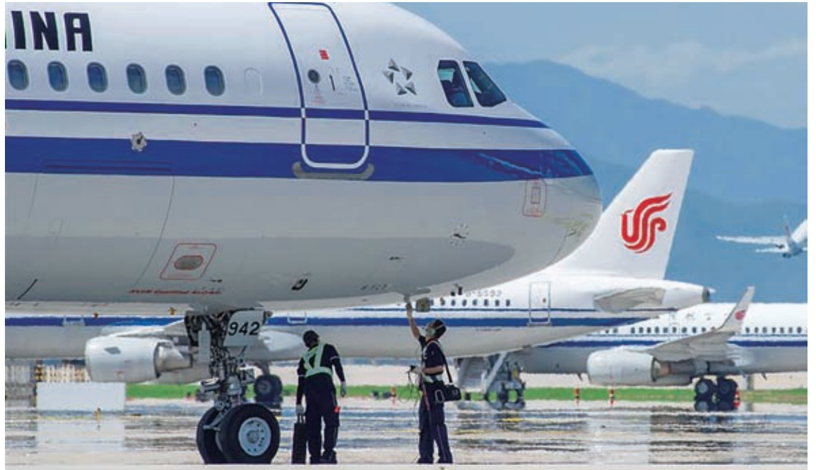
Mechanics inspect a passenger aircraft at Beijing Capital International Airport.